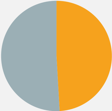
2015 Revenue ($Billions)